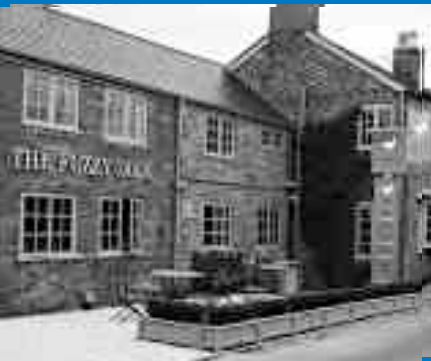
The Fuzzy Duck, Armscote