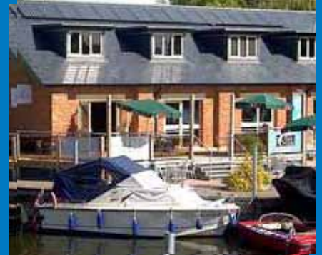
The Marina, Stratford upon Avon