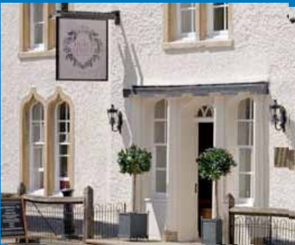
No 16. The Townhouse Stratford upon Avon.