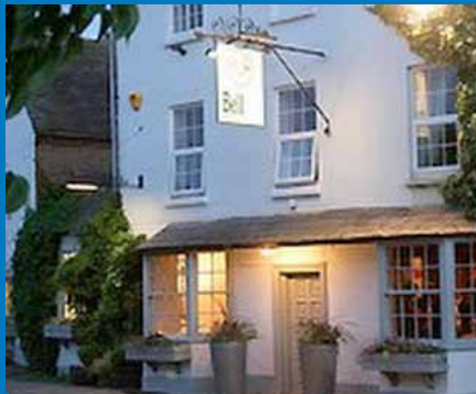
The Bell, Alderminster