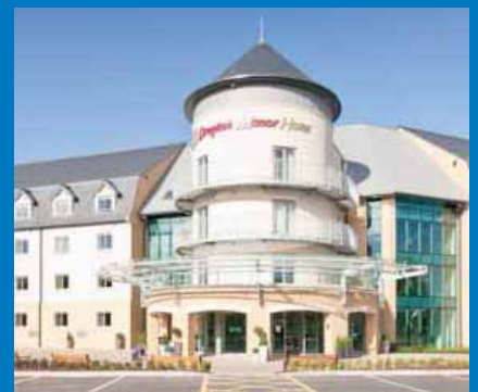
Drayton Manor Hotel