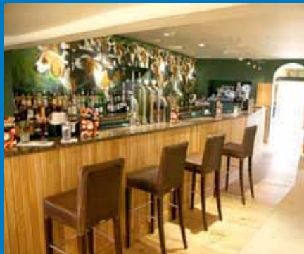
The Manor House Hotel, Moreton in the Marsh